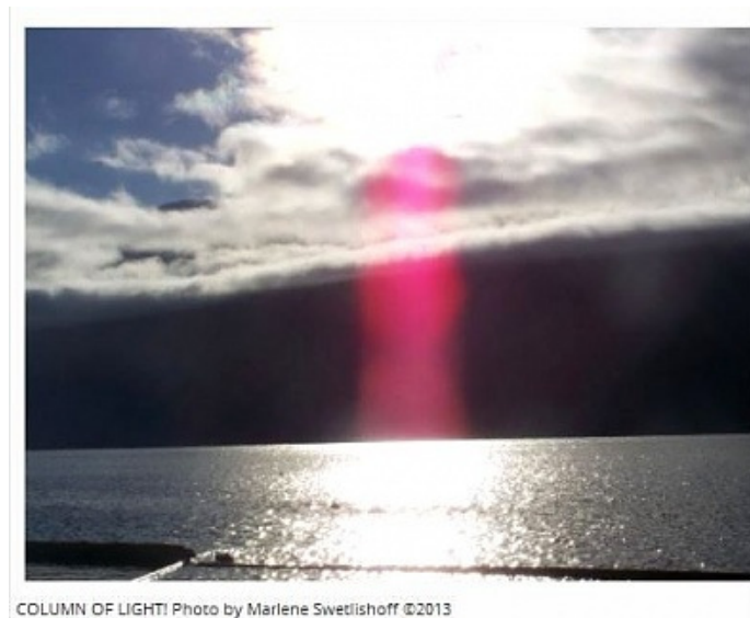
COLUMN OF LIGHT!

While there are many who may no longer be part, due to inactivity, by choice, or removed by Grand Master for violation of tenants, we are very pleased to welcome 13 new Knight Apprentices have joined, eager to become White Knights. You can view a list of these new members here www.ugd-edu.eu/knights.html . We wish to extend a very warm welcome to each and every one of you. The journey through knighthood is a magical one, and we wish you every success. While we encourage self study to further you along the continuum of spiritual progress, do feel free to connect with other knights who would be more than happy to answer any of your questions or offer some suggestions. Ask Grand Master to suggest the best Knight match for your quest.